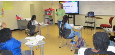
Financial Literacy at Carvers Bay Middle

Being a part of the community is important to GKCUC because we want to see our communities grow. In order to do that, we must do our part to give back through volunteer efforts, educational outreach and support for local community groups and non-profits. Recently, GKCUC got the opportunity to present at Andrews High, Carvers Bay Middle and the SC Computer Science conference. We got to read to students at Plantersville Elementary for Black River United Way and mentor students at Kensington Elementary for Miss Ruby's Kids. And we were happy to see you at local events like the FCA golf tournament and the Tideland Health Community Fair. Thank you for your commitment to GKCUC so we can remain committed to the community - to make us ALL better!