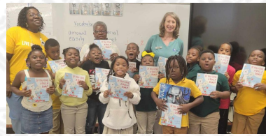
United Way reading at Plantersville Elementary